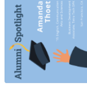
Alumni Spotlight Insta...